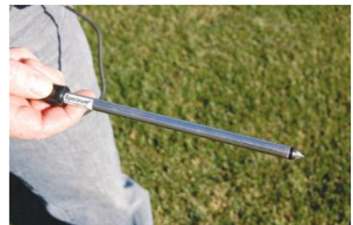
Exclusive Paired Sensor