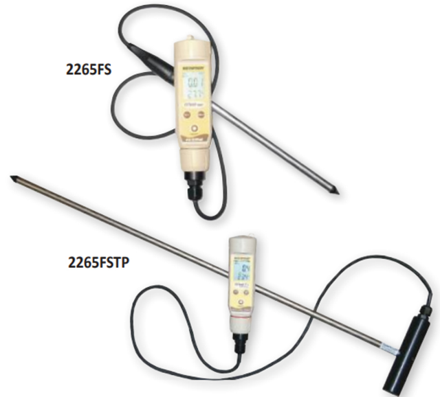
FieldScout Direct Soil EC Meter with 24 in (60 cm) T-Handle