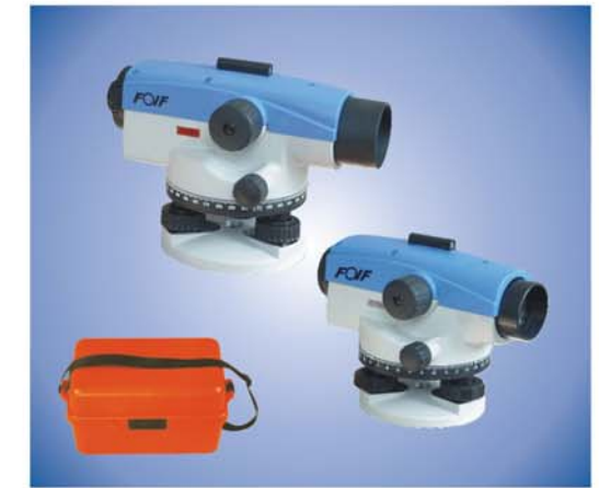
Carrying case and different color level

*Depending on staff and levelling technique